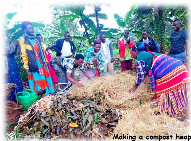
Making a compost heap

Our farm shows best organic practices to different groups and categories of people. Our enterprises include: piggery, dairy farming, goat rearing, local poultry farming, rabbit rearing, aquaculture, apiculture, crop farming with orchard plantation; seed bed rising in bags as the new addition. We train farmers and produce items for sale so as to sustain the farm. For far away communities we take the services nearer the people where we set up demonstration sites for training local farmers. This year we received 2,157 learners at the farm ranging from school children who were mainly from education institutions and individual farmers.