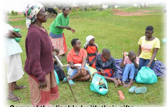
Some of the disabled with their gifts.

Once again we relay our deepest gratitude to you for your generous support for BkB We can never thank you enough but just know that we shall forever be indebted to you.