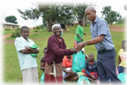
BkB's Manager handing out parcels