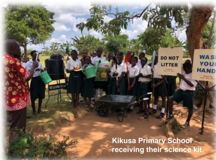
Kikusa Primary School receiving their science kit.

A total of 21 teachers from 6 schools trained in hygiene and sanitation and in the use of school gardens as a practical tool to foster adoption of skills, improve academic performance and boost food production at school. 4 of the 6 schools received science kits comprising of the seeds, garden tools and posters for the compound, handwashing stations, tip-taps. Teachers were also trained in soil fertility management, nursery bed management, space saving techniques and general principles and practices when managing a school farm.