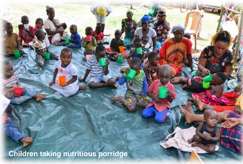
Children taking nutritious porridge