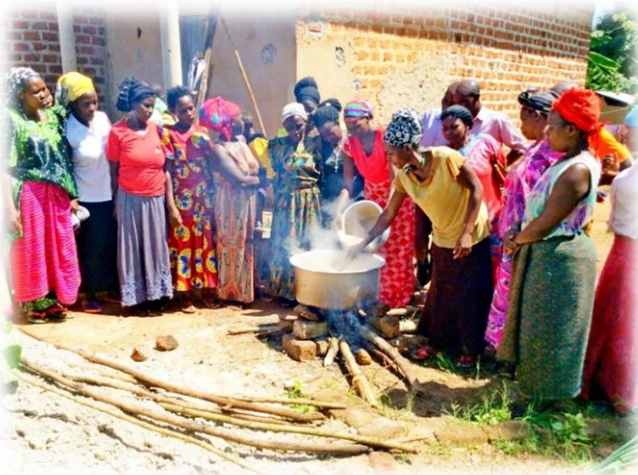
Kanziro villagers preparing 'porridge' for malnourished children

Preparing bean-eggplant relish and bean-silverfish relish which are high in protein.