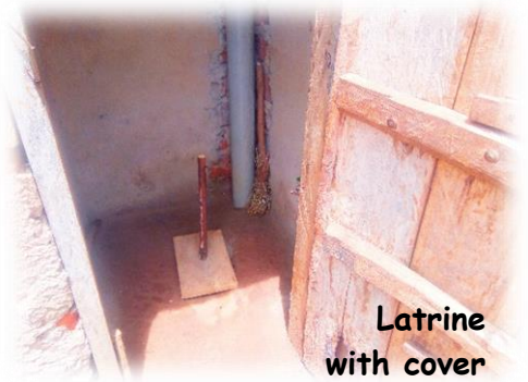
Latrine with cover