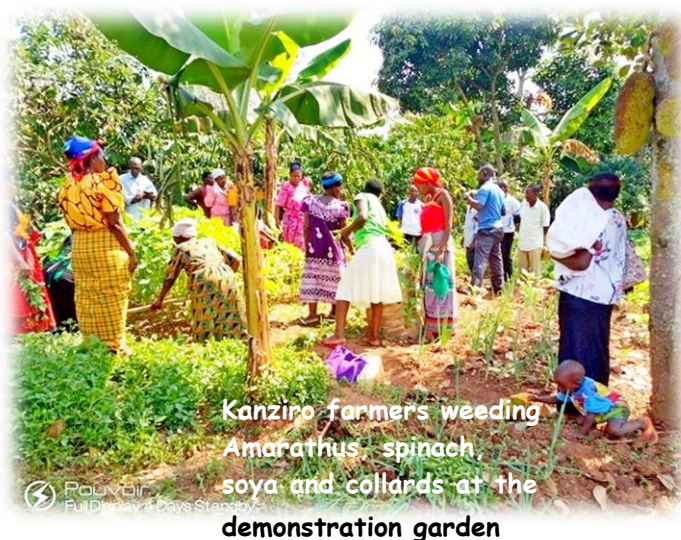
Kanziro farmers weeding Amaranthus, spinach, soya and collards at the demonstration garden

This year BkB scaled its activities to reach out to more people that need our services. We established six demonstration gardens in six villages as opposed to the previous two. These facilitate BkB's outreach work in Agriculture and Nutrition by bringing services nearer to the people. At the demonstration gardens, beneficiaries are trained in organic farming methods, principles and skills and in child and family nutrition. These trainings are complemented with demonstrations and home visits to farmers to offer guidance and help participants understand.