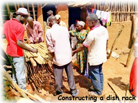
Constructing a dish rack