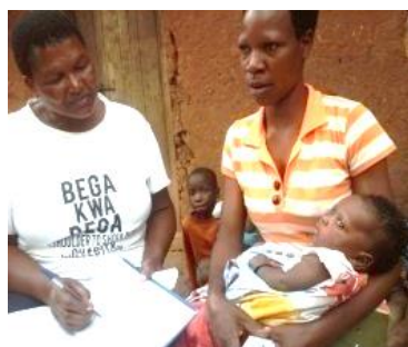
A nurse registering a patient

The Mobile Health Clinic (MHC) engaged in its usual activities of providing basic and primary health care. Health sustainability has also been highly emphasized with the usage of local medicines and herbs as an alternative to western medicines. With the support of Vibrant Village Foundation 20 mobile clinic sessions were conducted where 4,291 people were diagnosed and treated for basic illnesses. 1,914 were children, 1,404 women and 973 men.