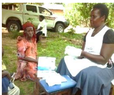
A nurse preparing to test for malaria