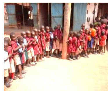
School children queuing for dewormers